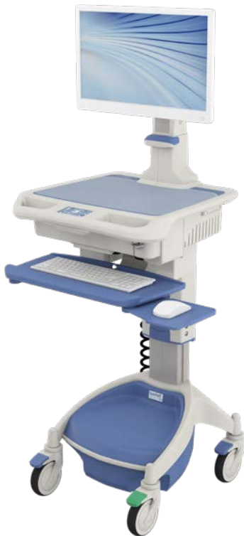
AccessPoint Workstation on Wheels