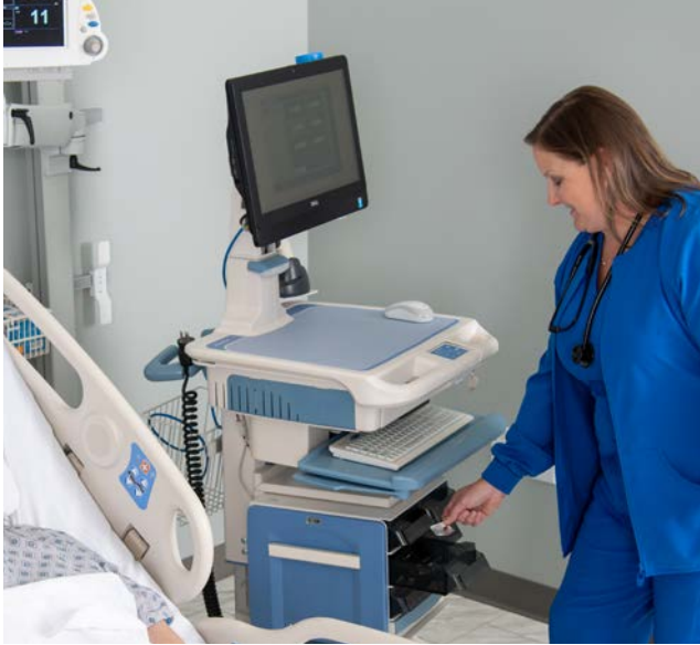
TouchPoint Medical's AccessPoint MD™ medication delivery workstation in a patient's room.