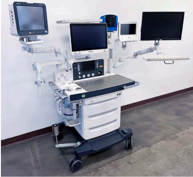
TouchPoint Medical's AccessMount™ 180 ICW Workstation and AccessMount™ 180 ICW Patient Monitor Mount.