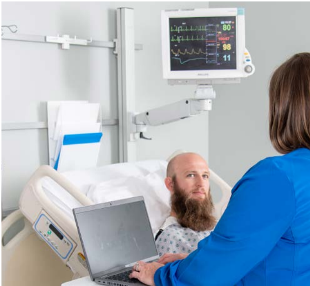
TouchPoint Medical's AccessMount™ 180 ICW Patient Monitor Mount on headwall in a patient's room.