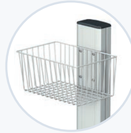
Metal Wire Storage Basket APQ-STRBSKT