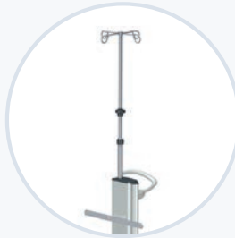
Adjustable IV Pole APQ-IVPOLE