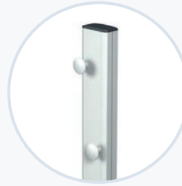
Cable Winder APQ-CBLWDR