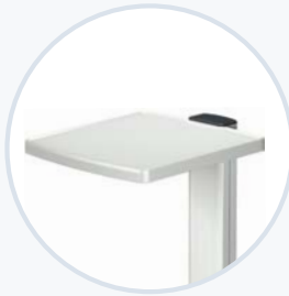
Shelf Load Capacity: 20kg (44lbs) APQ-SHELF

Our accessories help improve your workflow with effective ways to store, hold, and secure the items you rely on everyday.