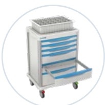
Removable Drawer Insert with Dividers

Multiple security options allow you to apply the right level of security to efficiently control medications and controlled substances from pharmacy to bedside.