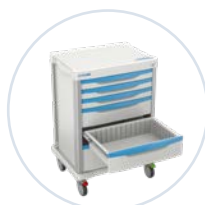
Removable Drawer Insert No Dividers