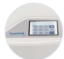
Touchscreen with RFID Access