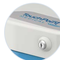
Security Locking Options